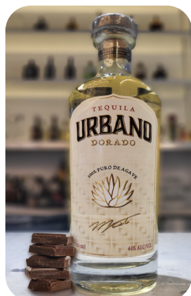
EL TESORO REPOSADO SINGLE BARREL: URBANO DORADO

Mezcal, tamarindo, tonic water, pinch of salt, muddle serrano, lime juice, splash of agave with a tajín rim 16